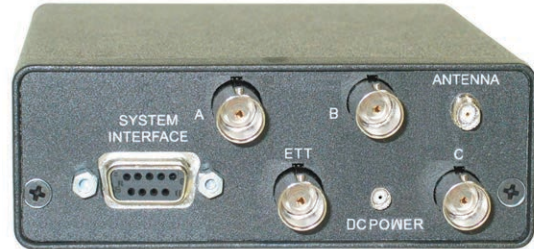
MGTR-II unit Rear View