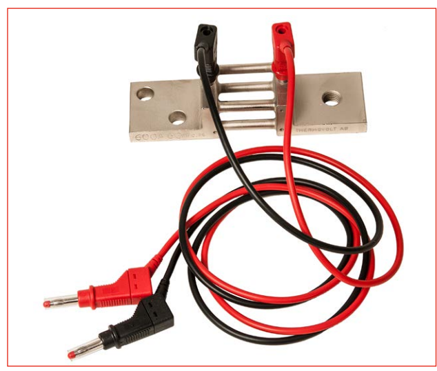
Current shunt for calibration, BB-90024

An optional calibration shunt (600 A/60 mV) can be ordered for MOM690. A regularly calibration is needed to make certain that the instrument readings remain correct.