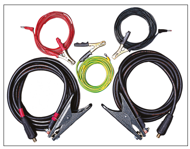
Cable set standard GA-05055 (current cables and sensing cables) and ground cable GA-00200.