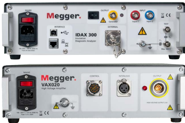
The test system: IDAX-300 and VAX020