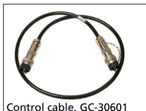
Control cable, GC-30601