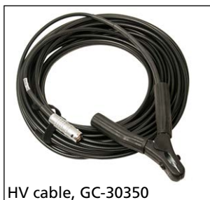
HV cable, GC-30350