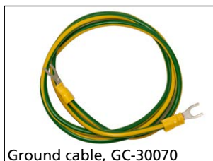
Ground cable, GC-30070