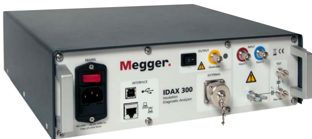
IDAX-300 Insulation Diagnostic Analyzer

CIGRE brochure 414: 2010 recognizes DFR/FDS as the preferred method for measuring moisture content in the cellulose insulation in power transformers.