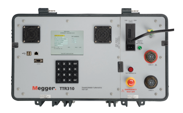
TTR310E — text-based unit with color display

The TTR300 is designed to be completely remote controlled via a PC running PowerDB LITE (included) or PowerDB (full version) PC software applications.