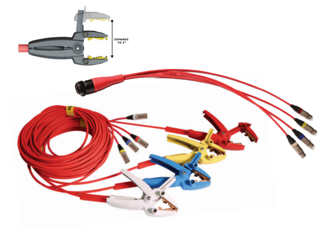
Available in 9m (30 ft), 18 m (60 ft) and 30 m (100 ft) lengths

Newly designed test leads, shown in image below, are universal and can be used for winding resistance (MTO3XX) or turns ratio (TTR3XX) instruments. Expandable jaws, shown in inset, allow for testing any size transformer.