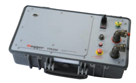
TTR300 — remote controlled "black box" unit

The TTR330A offers the same functionality as the TTR300 and TTR310E. The TTR330A is equipped with an industrial grade, 12-in. touch controller. The display is designed to operate in direct sunlight