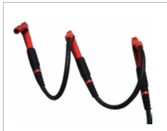
Installation of the 3-phase pliers' adapter set

For the proper installation of the elbow adapter, adhere to the installation instructions in order to avoid damage to both the specimen and the adapter. A tube of silicon grease will be enclosed with the delivery, which is required for the installation of the elbow adapter.