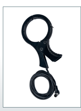
Induction clamp 12,5 cm and 17,5 cm

Megger Germany GmbH · Dr.-Herbert-lann-Str. 6 · D-96148 Baunach Tel. +49 (9544) - 680 · Fax +49 (9544) - 2273 team.international@megger.com