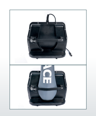
EML-Boot for marker location