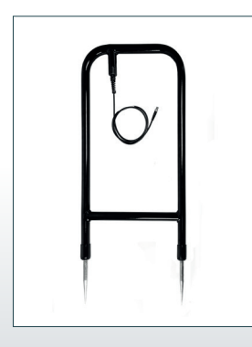
A-frame for sheath fault location