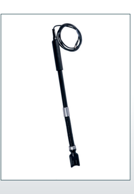
Flexible stetoscope for cable identification in hard-to-reach places