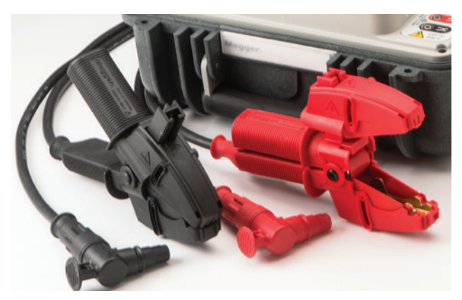
A new tough adjustable clamp has been designed to ensure flexibility in many applications and provides a good connection with the test piece.

In Continuous mode the user connects the test leads and presses the TEST button, initiating the test procedure. The instrument will continue to test, updating the display after each new test cycle, until the TEST button is pressed or the test procedure times out.