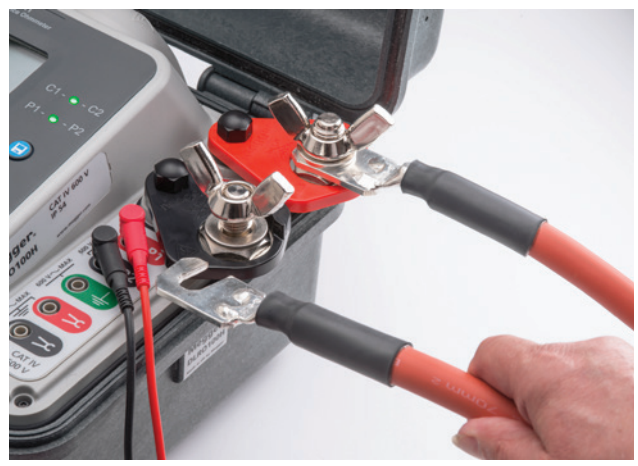
A new terminal adapter has been designed to enable the use of users own test leads.