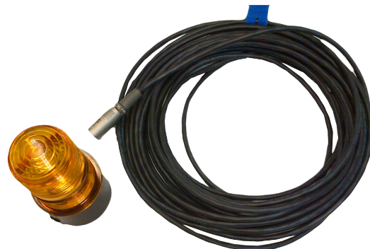
HV Strobe and Leads Cat # 1004-639 Length: 60 ft (18 m) Weight: 2.3 lb (1.1 kg)