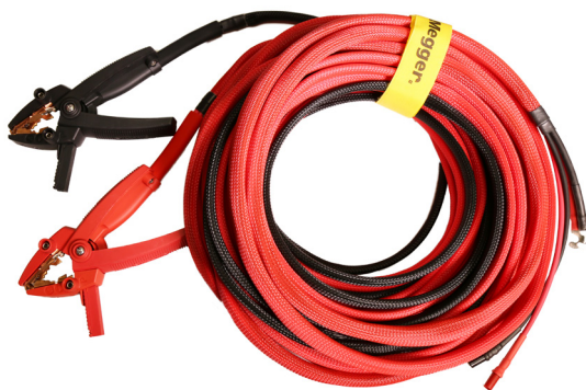
Universal Kelvin Lead Set

Universal Kelvin Clips make connections to transformers easy and secure, replacing the traditional two leads with one lead. Max opening: 4 in. (10 cm) Included: two banana plug inputs for lead connection to small specimens.