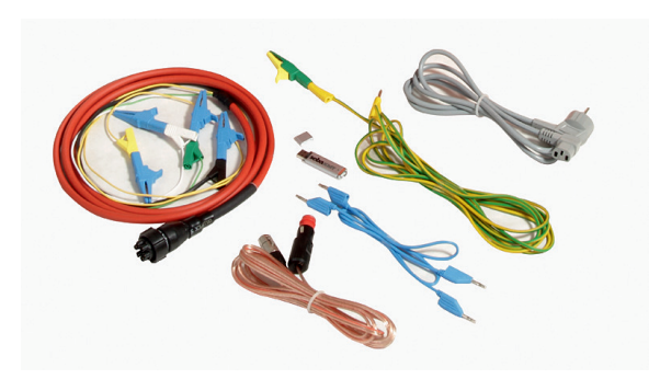
Test lead 5, 10, 15, 20 m