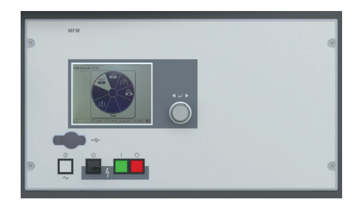
19" version for vehicle