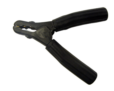
Connection set for HV connections

The information in this document is subject to change without notice and should not be construed as a commitment by Megger Germany. Megger Germany assumes no responsibility for any errors that may appear in this document.