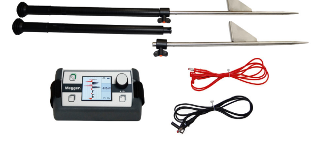
ESG NT / ESG NT2 earth fault probe for DC step voltage