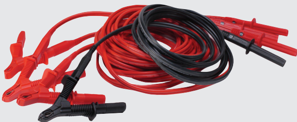
Detachable IEC61010-compliant combined HV / LV Kelvin test leads